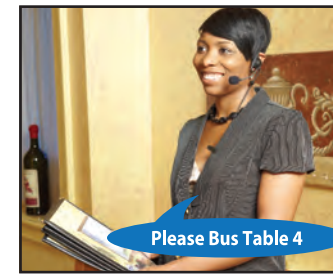
Please Bus Table 4