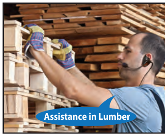
Assistance in Lumber