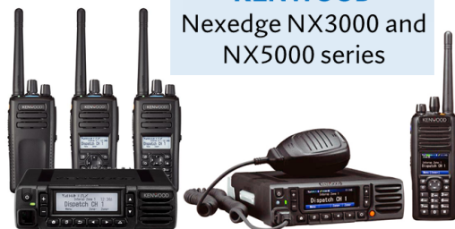
KENWOOD Nexedge NX3000 and NX5000 series