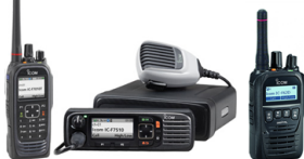
ICOM IC-F52D/62D IC-F7000 IC-F5400D/6400D IC-F7500