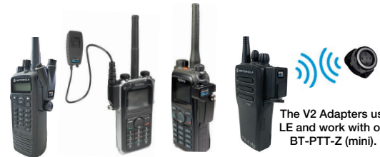
The V2 Adapters use LE and work with our BT-PTT-Z (mini).

Wireless Adapters shown on various radios