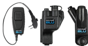
PRYMEBLU Wireless Adapters