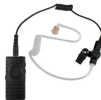
Shown on KIT-2