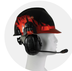
BTH-700-MAX-HMB (Helmet not included)